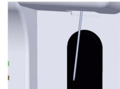
Automatic tittle sampling