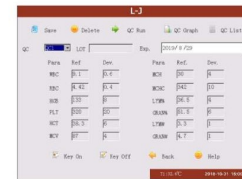
Many kinds of QC mode